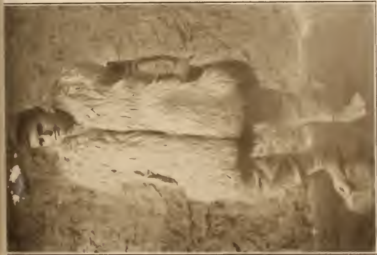
ON LAKE SKUTARI